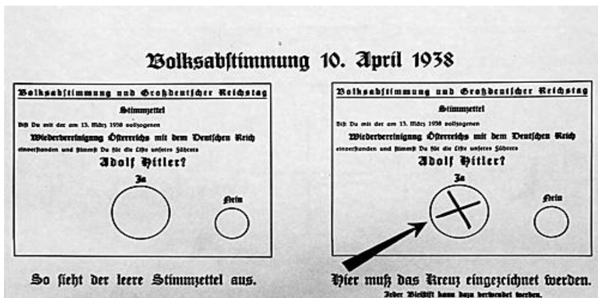
Illustration A: Ballot Paper for the Anschluss Plebiscite: The specimen on the left shows an empty ballot paper. The specimen on the right shows where “you must put your cross”. Note also that the box for ‘Ja’ (‘Yes’) is considerably larger than the box for ‘nein’ (‘No’)

intimidation and control; of voting at gun point and facing a severe fine for not voting 36 . The case study literature suggest point to many examples of dictators that “exploited to the full the modern totalitarian plebiscite...as a means of demonstrating ...of indoctrinating the people and of testing...control over them” 37 . The aim of the plebiscite, in other words, is not to win support of the people, rather “plebiscites in totalitarian systems”, in the words of Juan Linz, “test[s] the effectiveness of the party and its mass organizations in their success in getting out the vote” 38 . Seen in the light of this the paradox dissolves and the plebiscite – under tyrannies – becomes a straight, if ingenious, mechanism of repression and control.