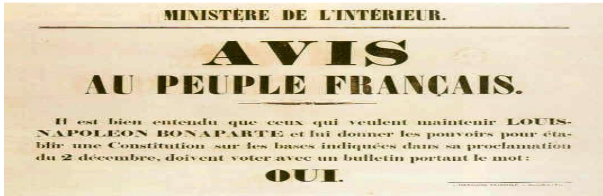
Illustration B: Ballot paper from the 1852 plebiscite in France on the rule of Napoléon III. The voter has but one option ‘Oui’ (‘yes’).

In this light it is not surprising that there are examples of repressive plebiscites when the voters were offered only one choice, namely ‘yes’ (As was the case in France in 1852) (See Illustration B).